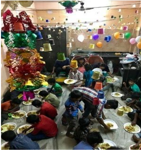
We celebrated Christmas in a very special way