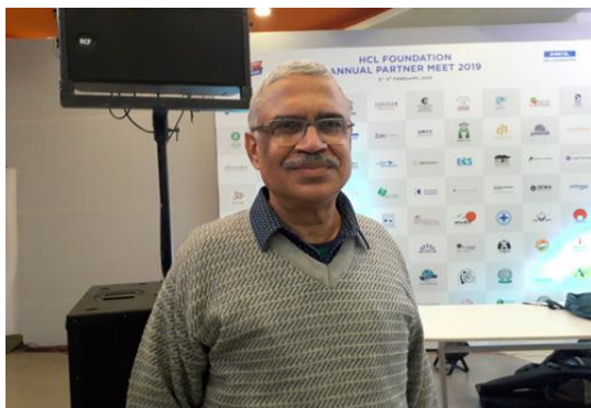
Mukti participated in Annual Partner Meet "Partnership For Change 2019" organized by HCL Foundation on 5 th & 6 th February at HCL Campus, Noida