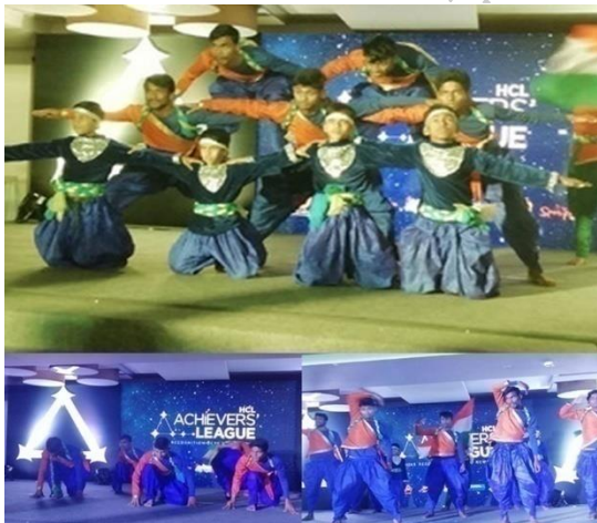
Boys of our Rehabilitation Home and boys from our Open Shelter participated in a program organized by HCL Technologies on 20th February 2019 at Hotel Sonnet, Salt Lake and earned huge appreciation.