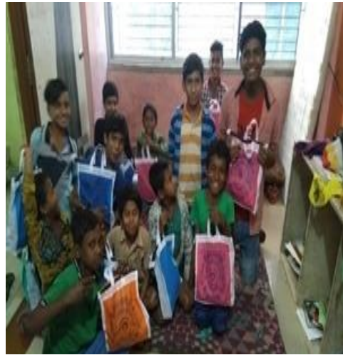
We welcomed the New Year and made it special by spreading smile and happiness among our children.